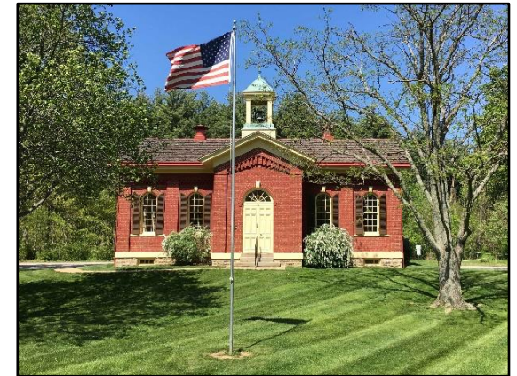
Little Red Schoolhouse, 1873

"Keeping Indian Hill's Past and Present Alive for Tomorrow"