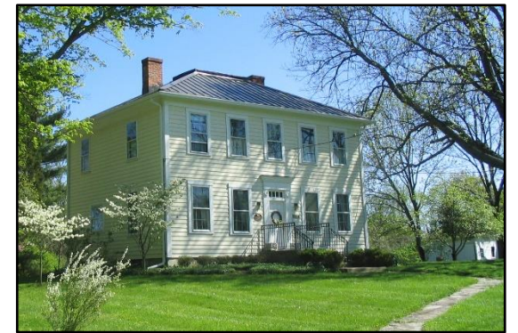
Buckingham Lodge, 1861